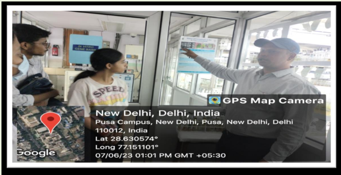
Visit to Tissue Culture Laboratory