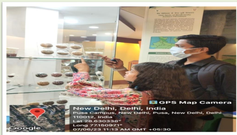
Visit to the Plant Germplasm Resource Museum