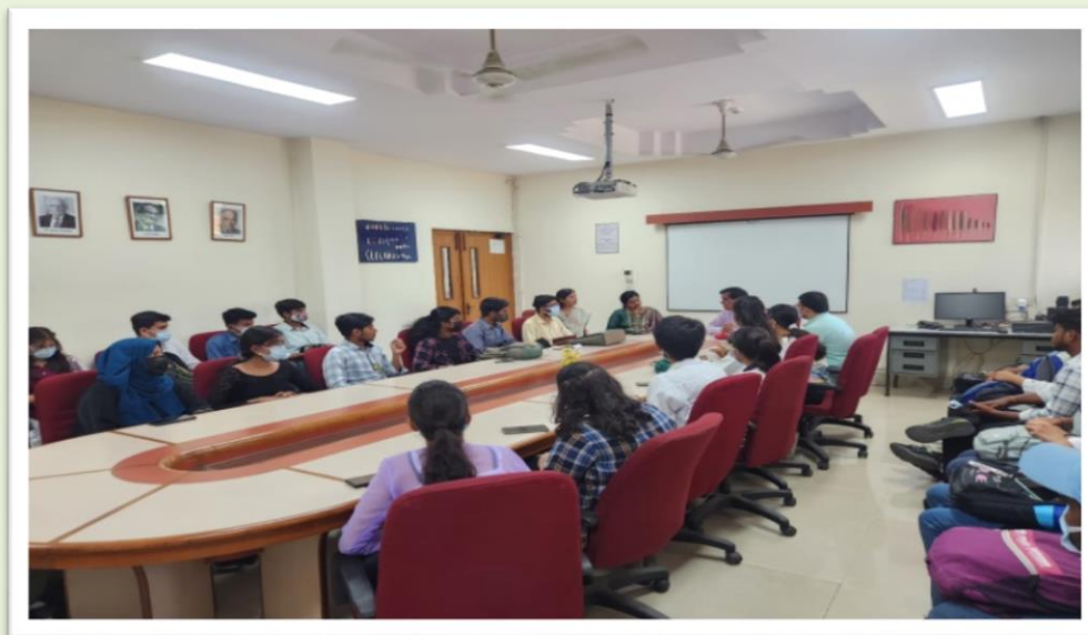
Lecture on Germplasm Collection and Conservation